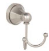
SN Satin Nickel