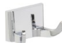
PC Polished Chrome