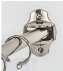
SN Satin Nickel