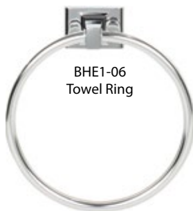
BHE1-06 Towel Ring