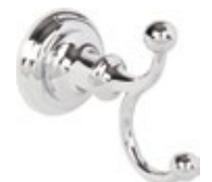
PC Polished Chrome