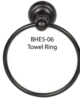
BHE5-06 Towel Ring