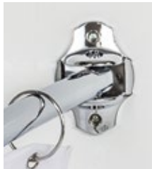
PC Polished Chrome