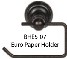
BHE5-07 Euro Paper Holder