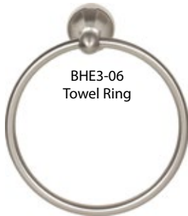
BHE3-06 Towel Ring