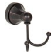
DBAC Brushed Oil Rubbed Bronze