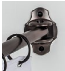
DBAC Brushed Oil Rubbed Bronze