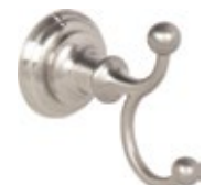
SN Satin Nickel