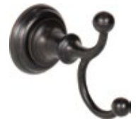
DBAC Brushed Oil Rubbed Bronze